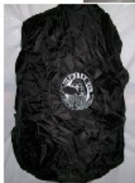
Ulysses Backpack. Has front strap to prevent slipping when riding. Carry your phone, wallet, keys, camera etc. Comes with weather proof cover which tucks away in its own pocket when not needed. Price $28