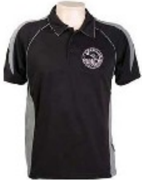
Men's black and ash Polo shirt. Price $28