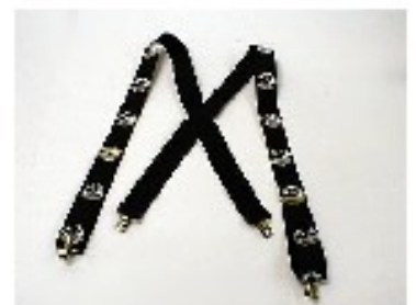
Black braces with Old Man Logo. Regular or large sizes. Price $29