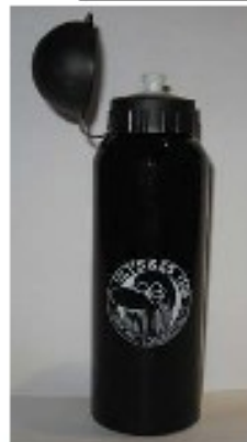
Ulysses water bottle. 500ml capacity strong but light, stainless steel.