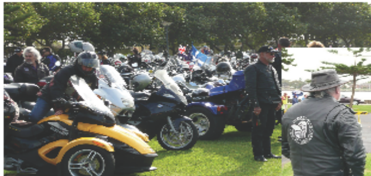
(Above) Ulysses Motorcycle Club - supporting Kolling's Rheumatoid Arthritis Research