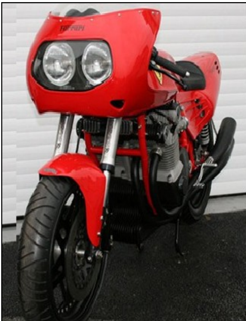
The only Ferrari Motorcycle ever made

http://motoring.ninemsn.com.au/slideshow_ajax.aspx?