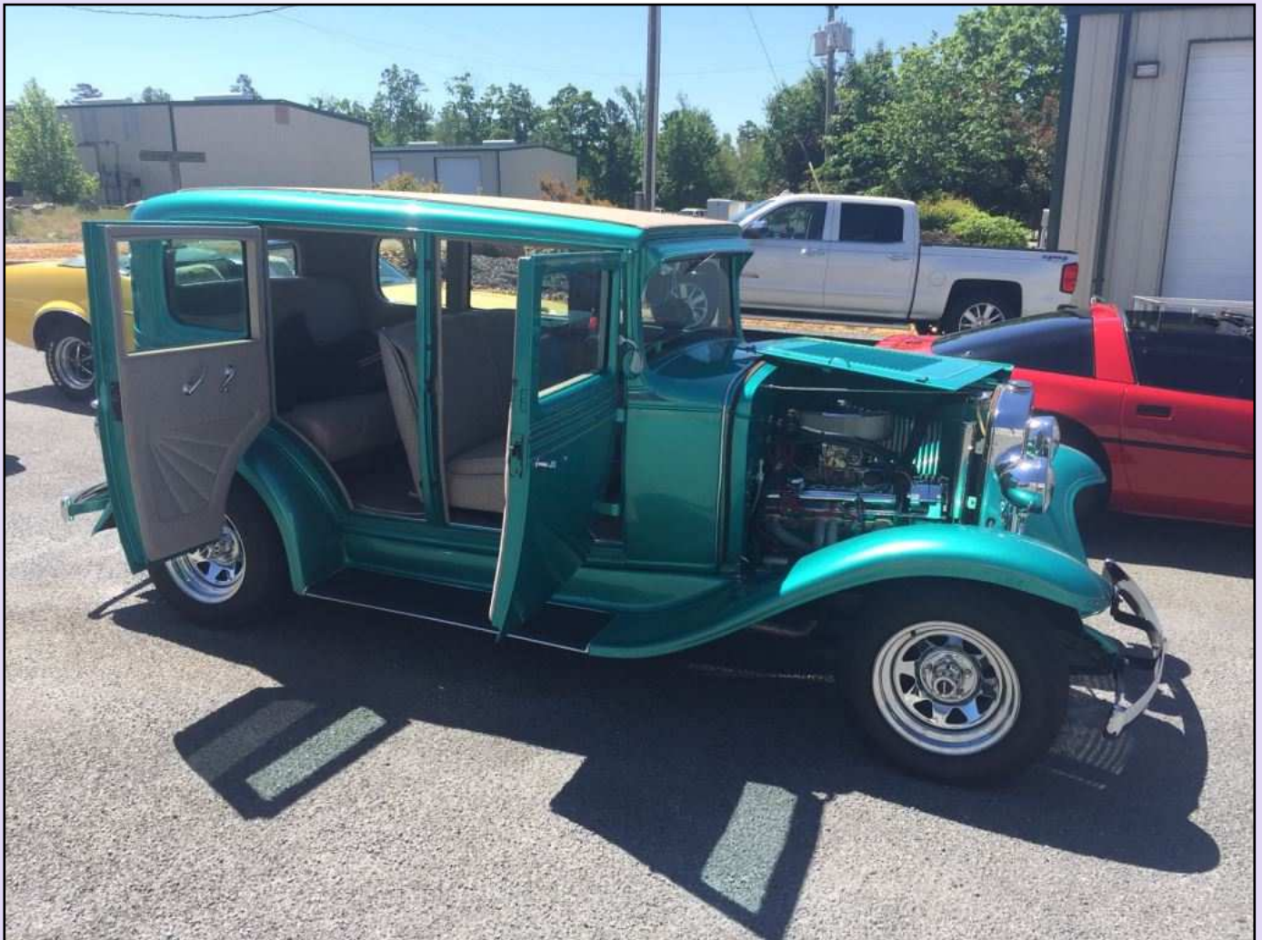
Another classic from the US