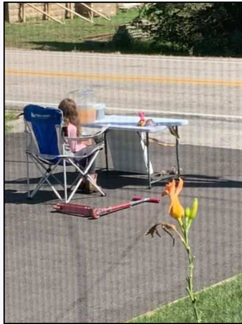
Lemonade stand currently open in Chili for interested parties...

Members of the group reached out to the mum on Facebook to say thank you and they've kept in touch since.