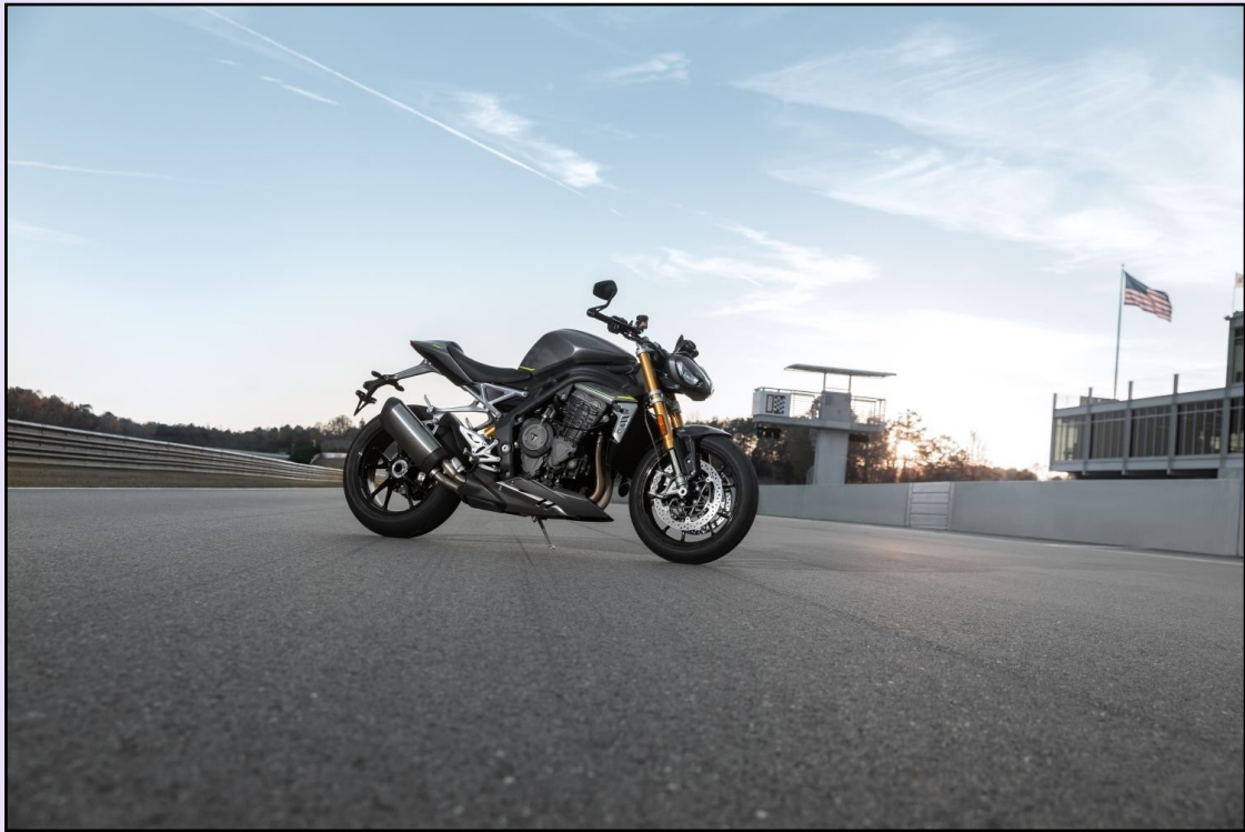
2021 Triumph Speed Triple 1200 RS

In addition, the Speed Triple RS 1200 will be offered with a 2-year unlimited kilometre warranty. For further information, contact your local Triumph Motorcycles Australia dealer.