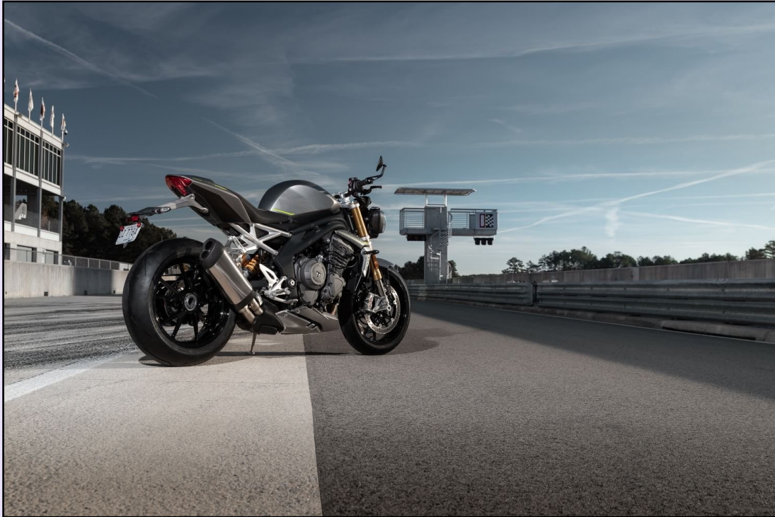
2021 Triumph Speed Triple 1200 RS

With a new lightweight chassis, new rider ergonomics and a more dominant and purposeful riding position, the new Speed Triple 1200 RS is nothing less than a handling revolution.