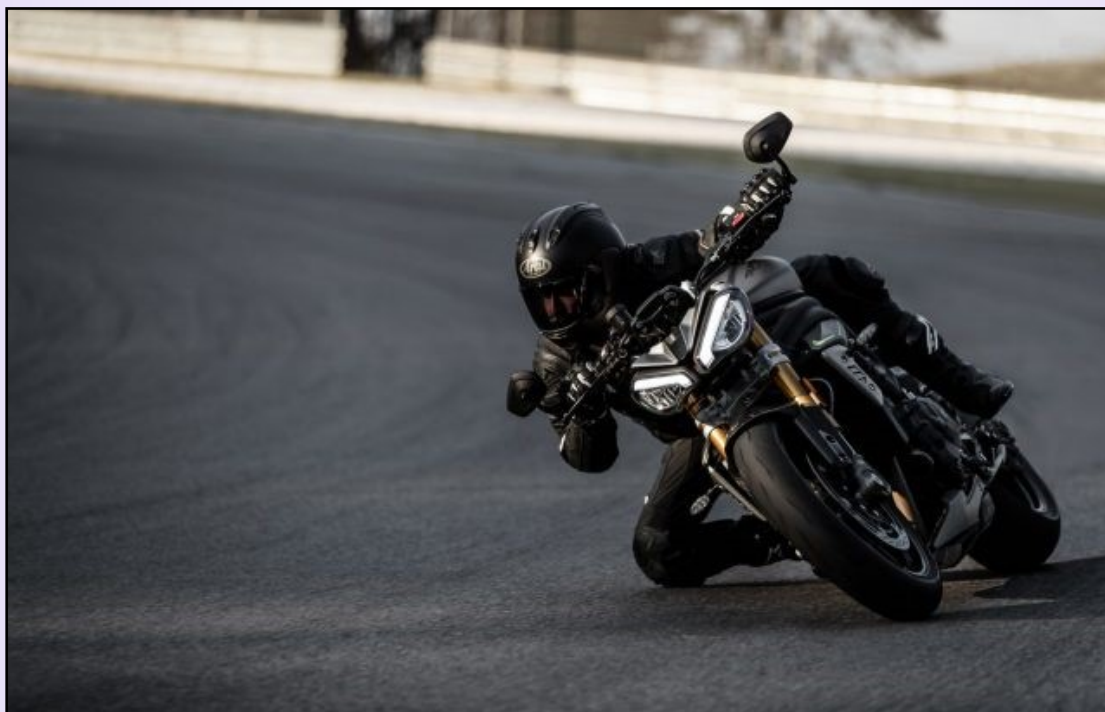
2021 Triumph Speed Triple 1200 RS

DESCRIBED as an absolute revolution in terms of power, performance, handling and technology, the 2021 Triumph Speed Triple 1200 RS is the new definition of pure, aggressive attitude, poise and style.