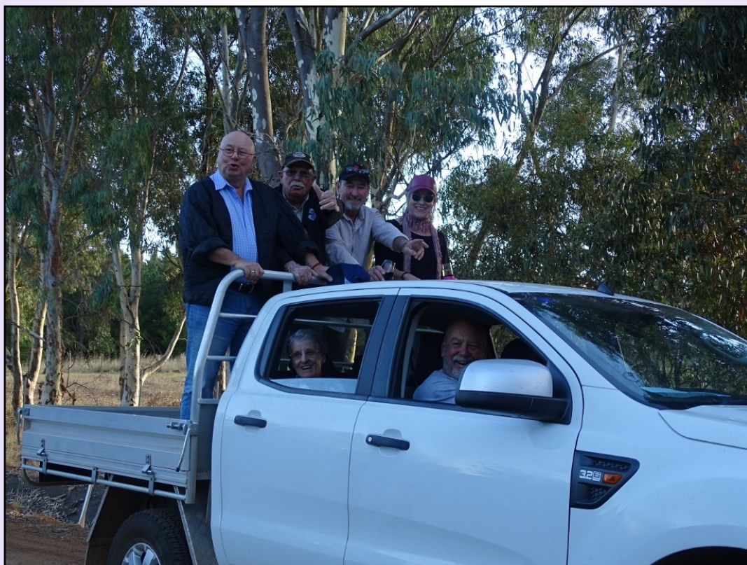
Time for the Royal Tour