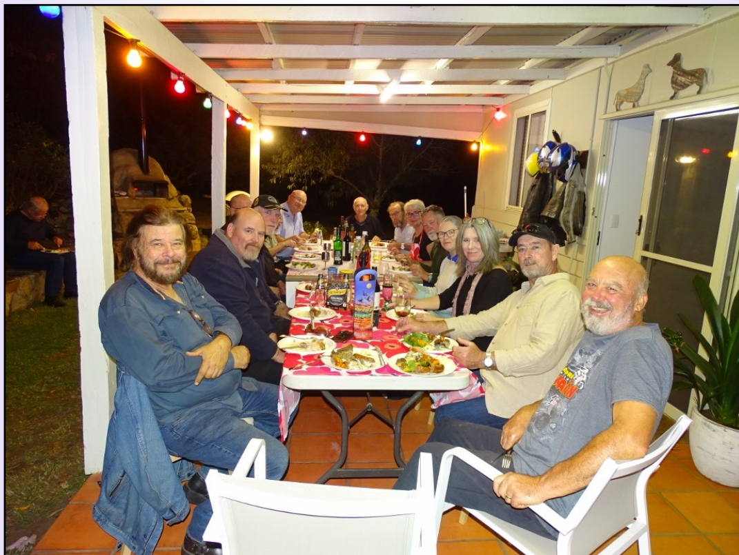
What a meal!