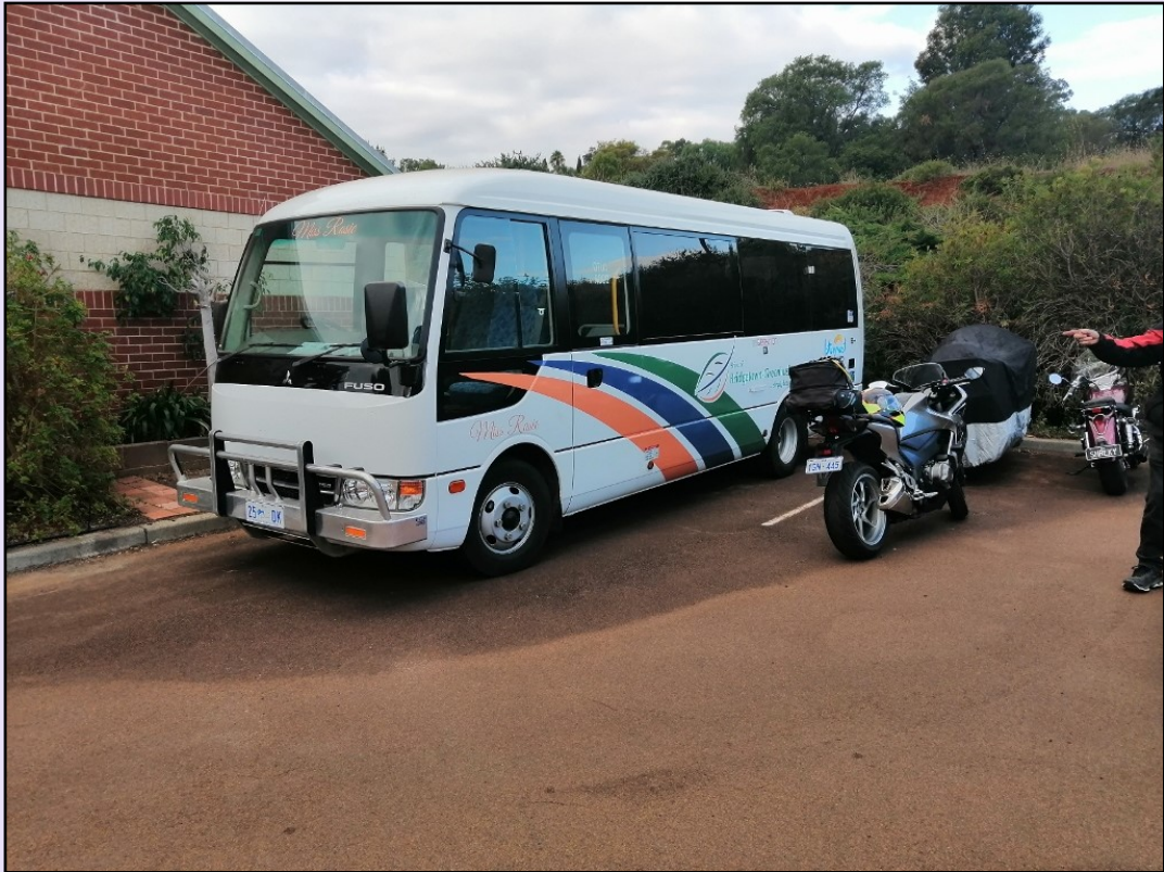
Means of commuting between Bridgetown and Winnejuw