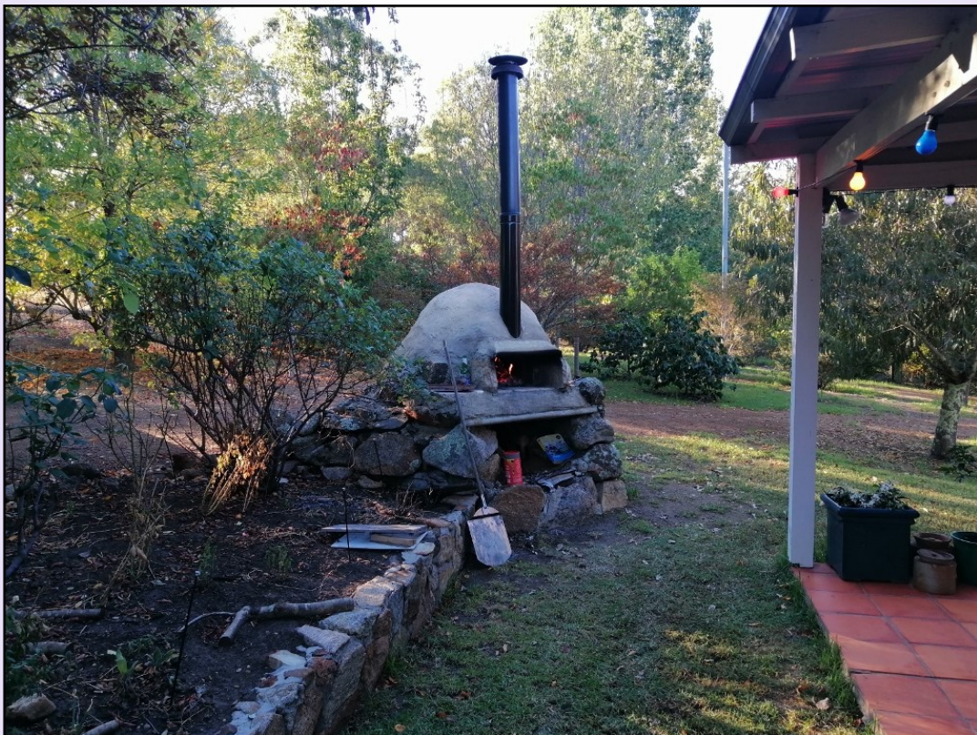
The origin of our beautiful meal