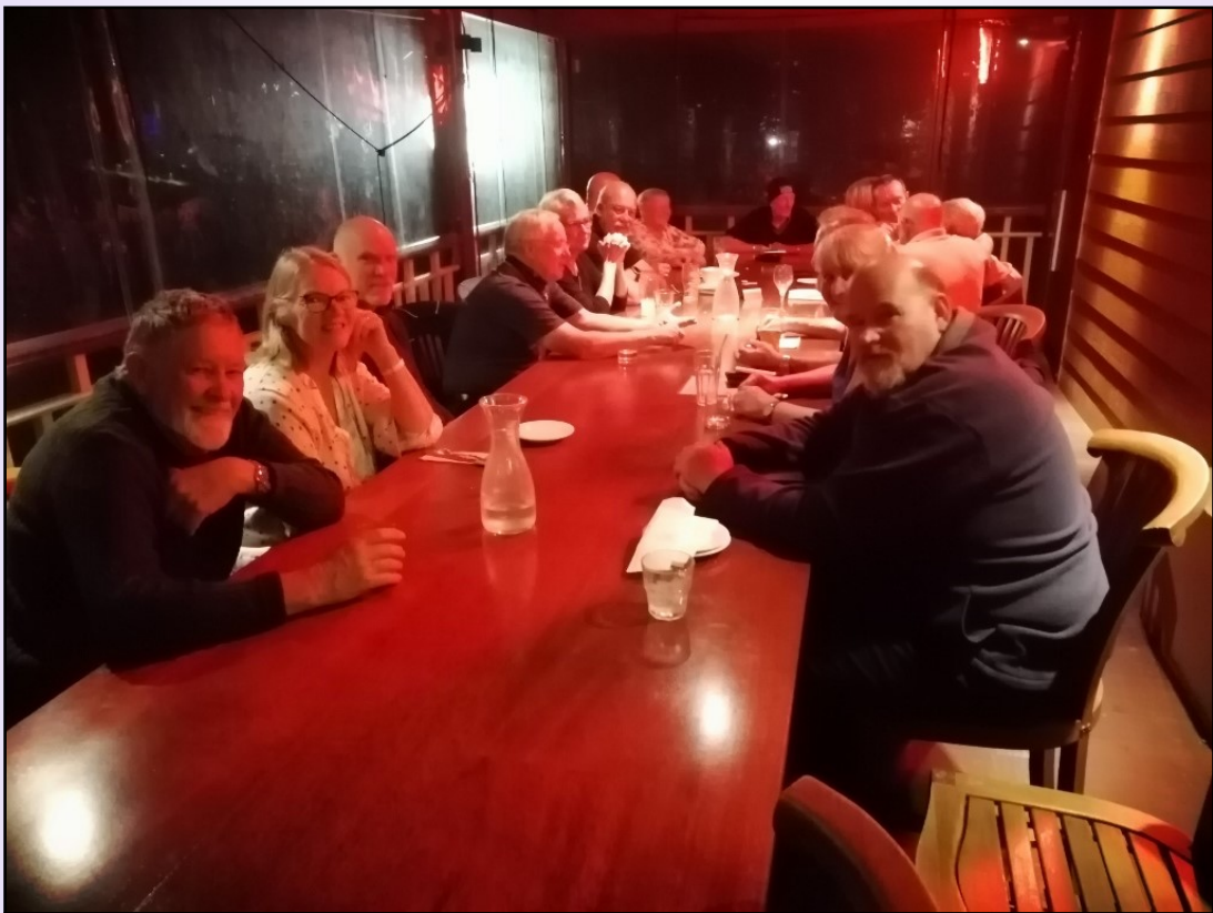
Dinner at the Bridgetown Hotel