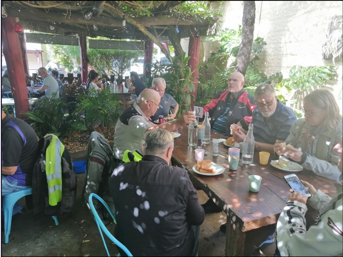
The 'so called' Grape Vine Café in Nannup