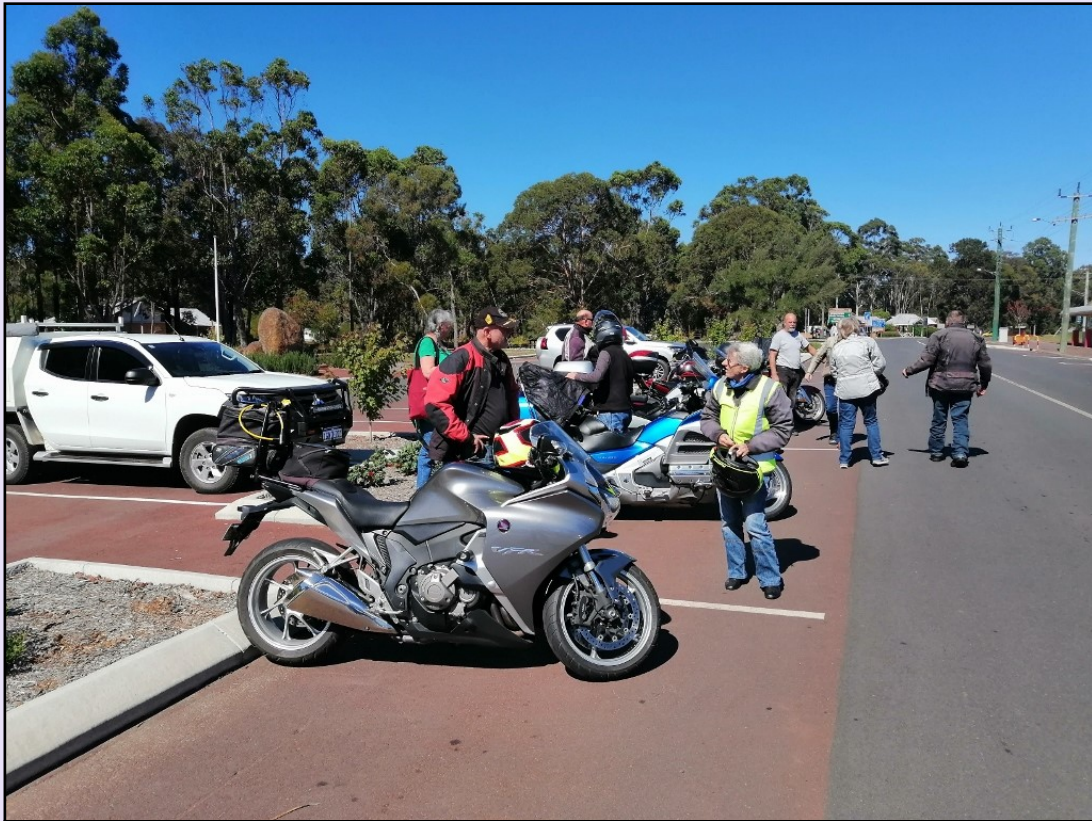
Northcliffe for lunch