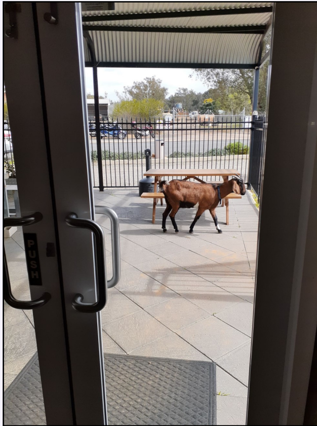
Some photos from Paul's latest Wandering ride