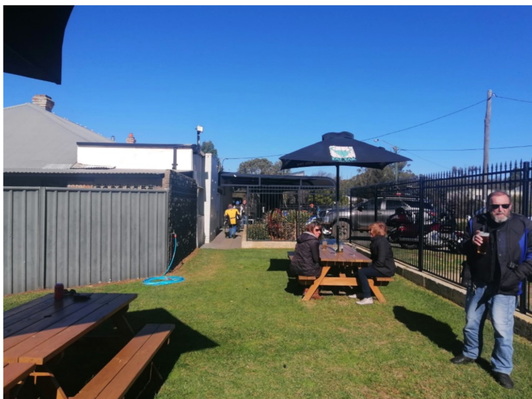
Cold but beautiful day ay Wandering Tavern