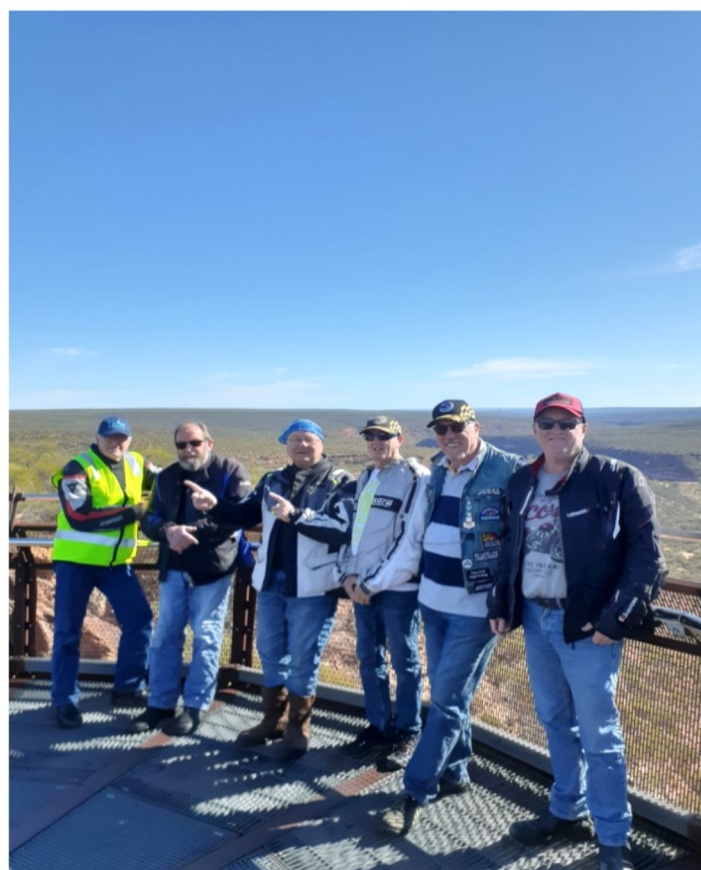
At the Skywalk