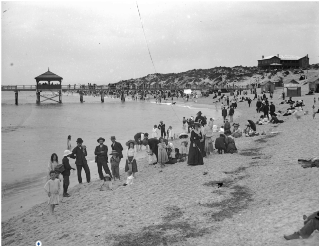
Cottesloe Beach 1907