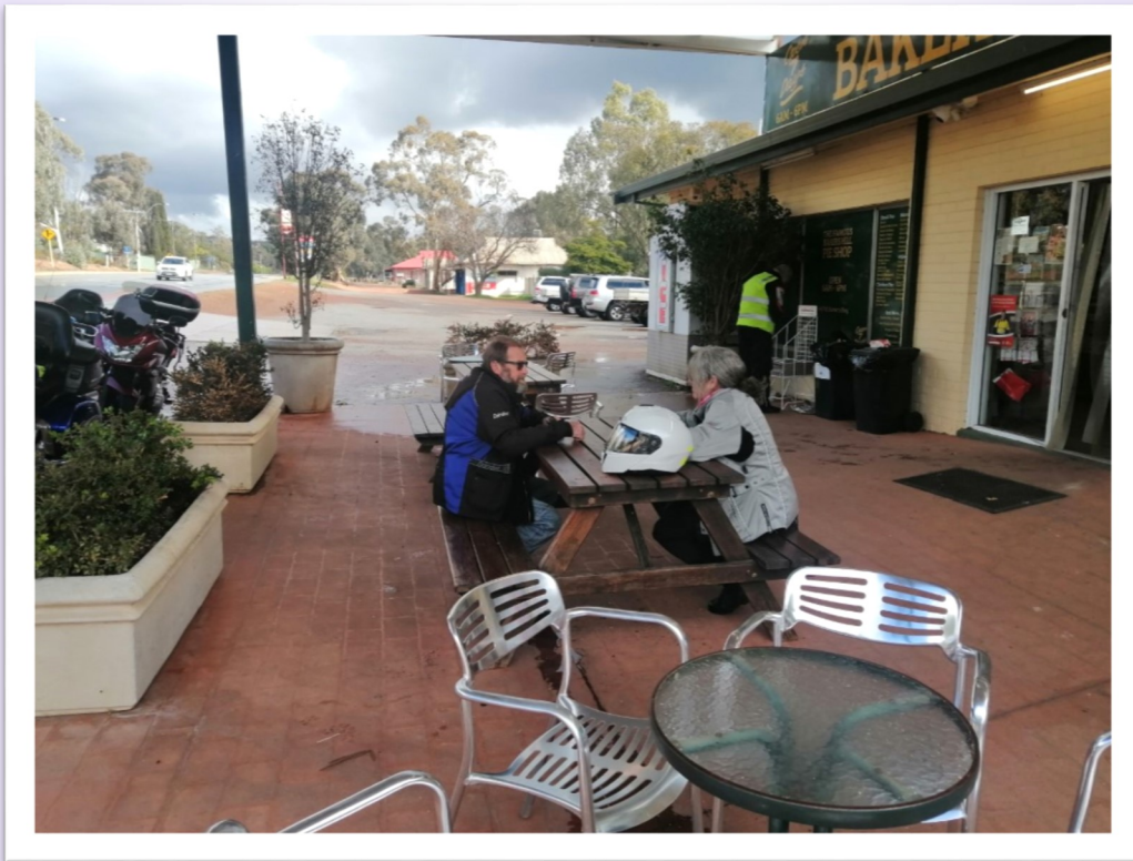
Great weather ahead