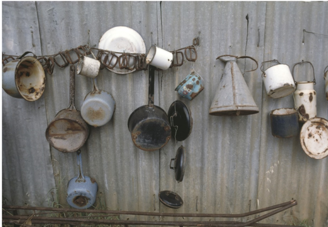
Part collection of tip rubbish in Coolgardie