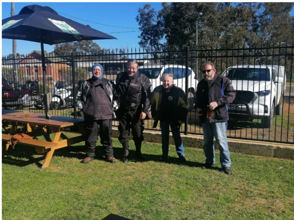
What a great looking bunch