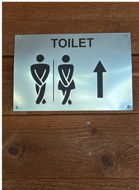
Serpentine Dam Café toilet sign (utilised and sent by Andy Fotheringham)