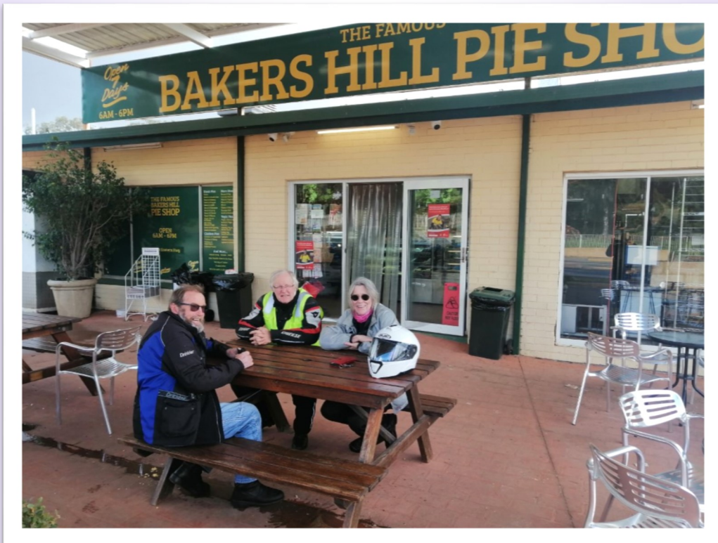
Wet weather actually held out for most of the ride