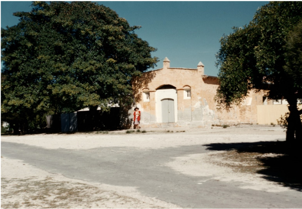
Old Chapel, Rottnest Island