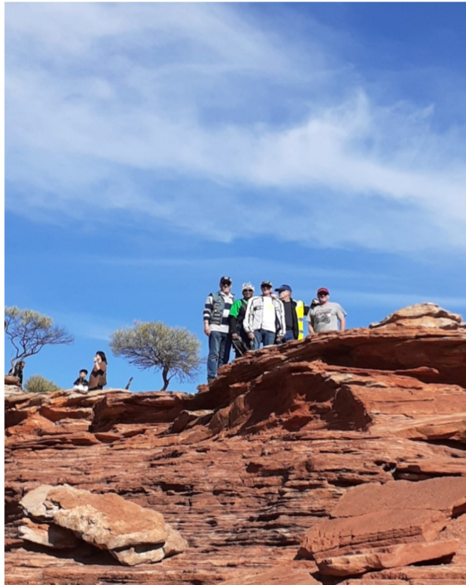
Above nature's window