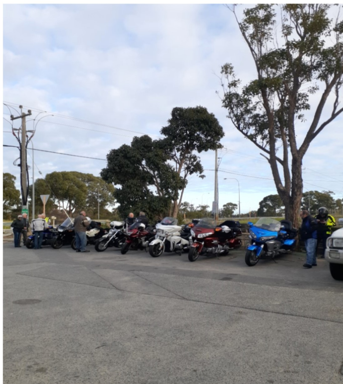
Ready to leave