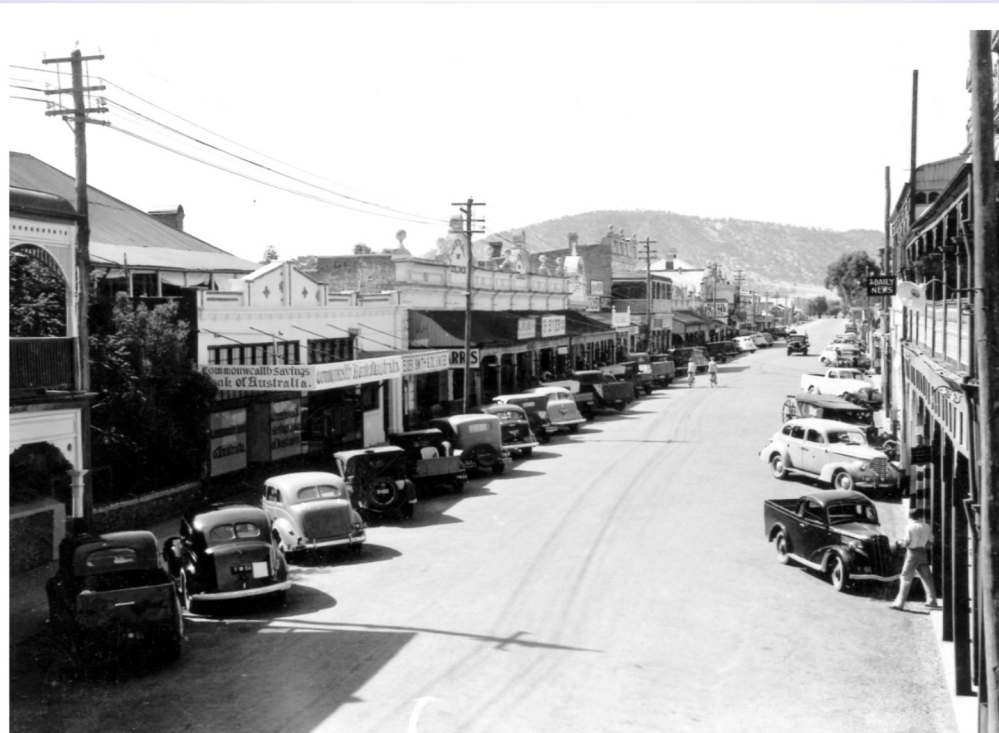
Avon Terrace, York