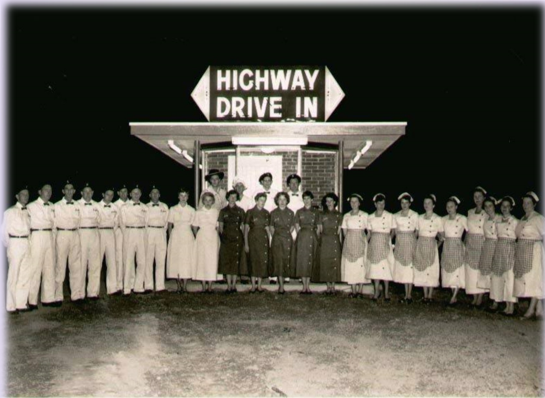
The Good old Drive-In