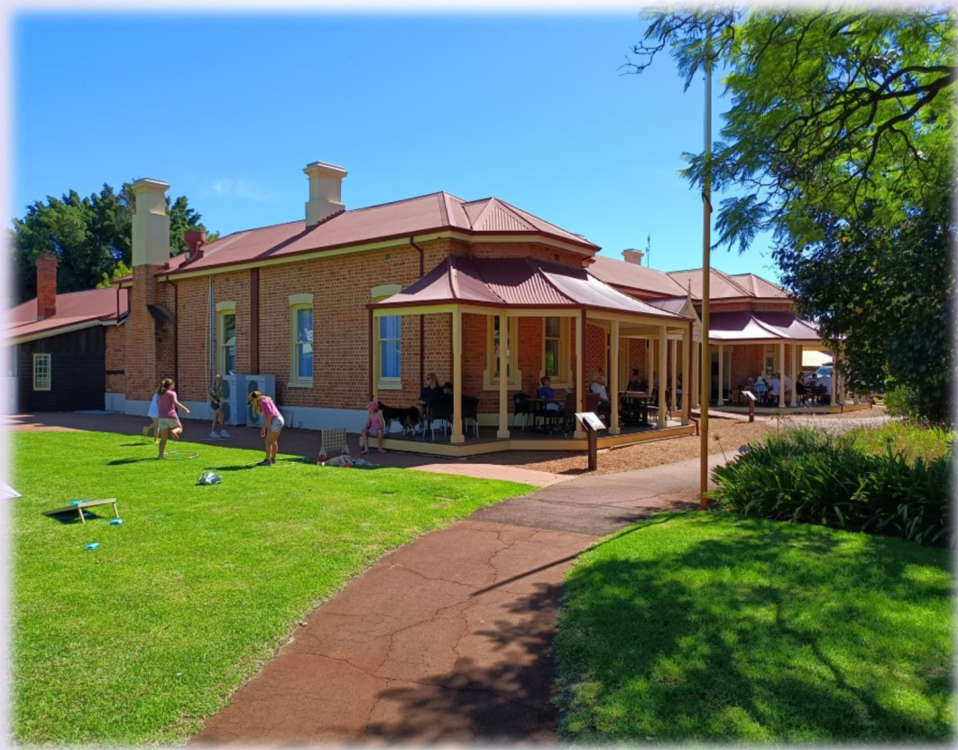
Morning Tea at Edenvale Heritage Tearooms Pinjarra