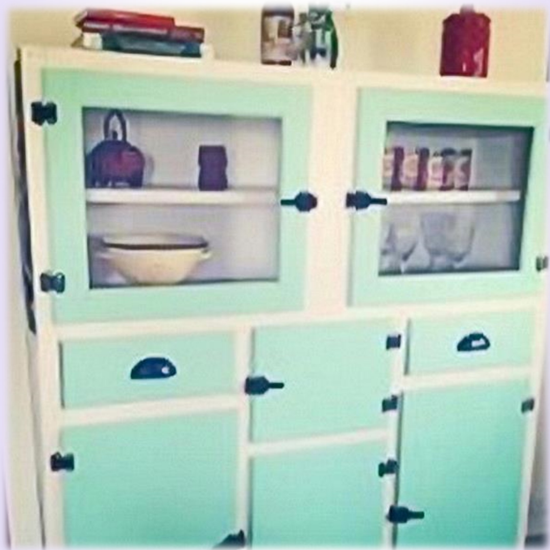
Many homes had one